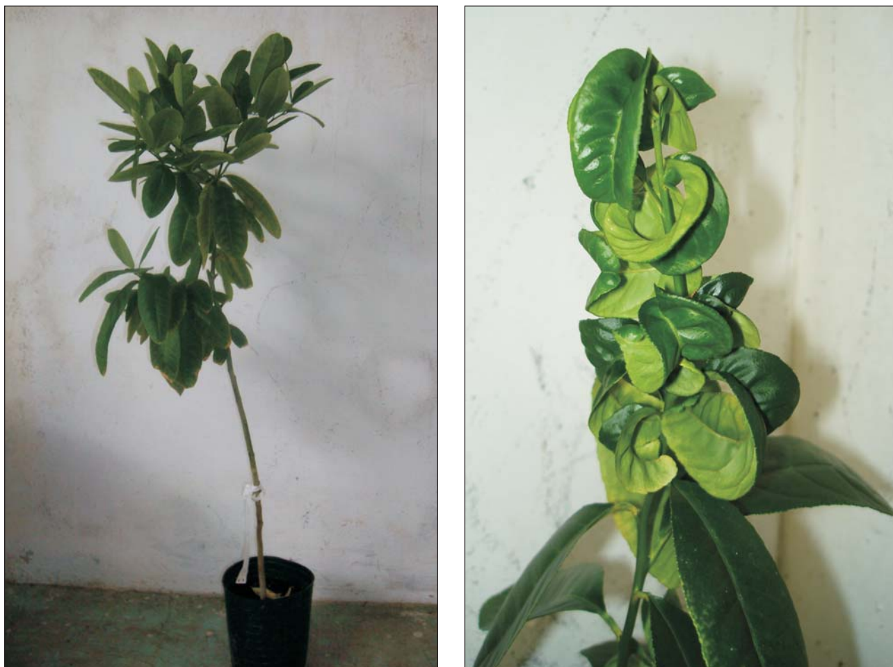
Figure 1. Etrog citron grafted on rough lemon. Left: negative control (non inoculated) and right: positive control with exocortis symptoms.